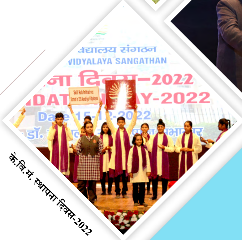
के.वि.सं. स्थापना दिवस-2022