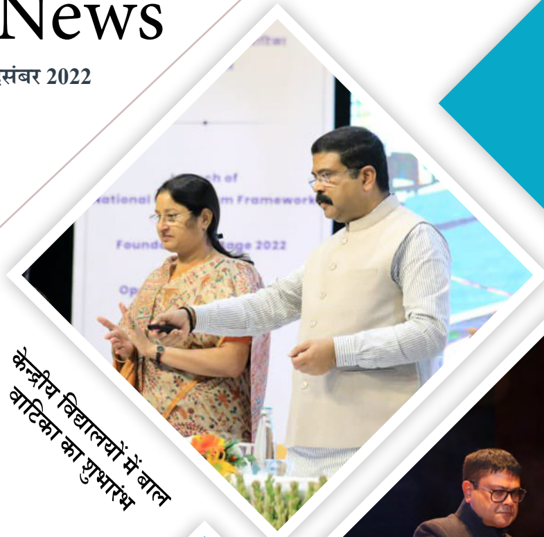
केन्द्रीय विद्यालयों में बाल वाटिका का शुभारंभ