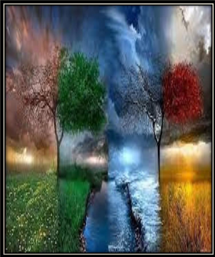
SEASON AND CHANGES