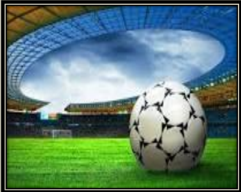
SPORT HAS THE POWER TO CHANGE THE WORLD