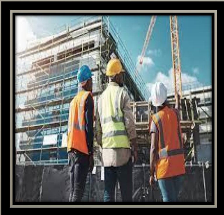
CONSTRUCTION OF A BUILDING