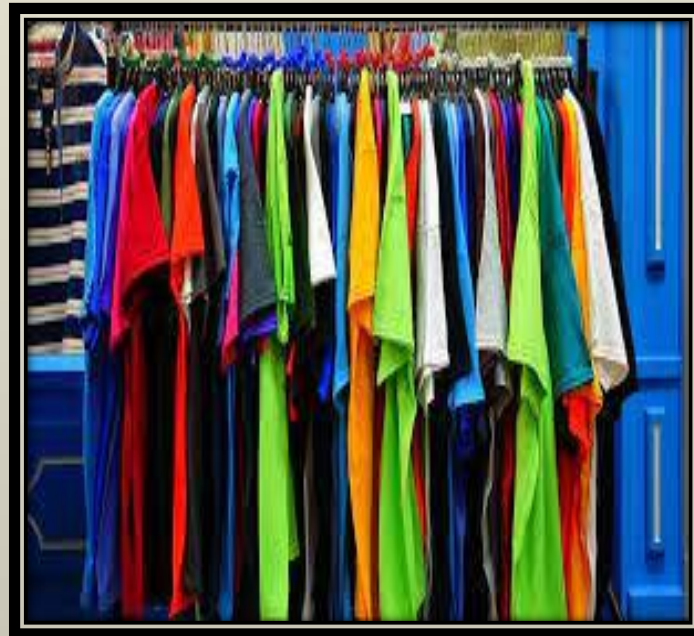
CLOTHING-The Attire of Existence