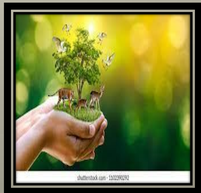
CONSERVATION OF PLANTS AND ANIMALS