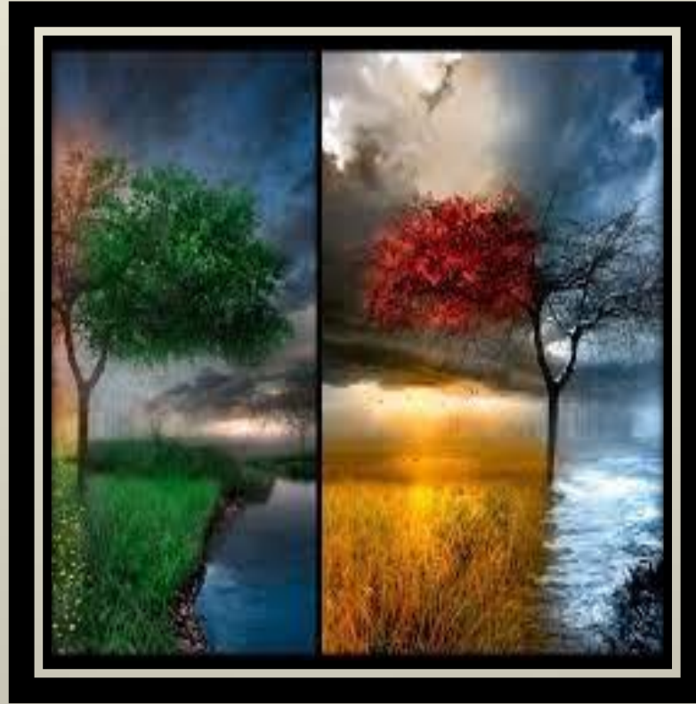
A JOURNEY FROM SPRING TO WINTER