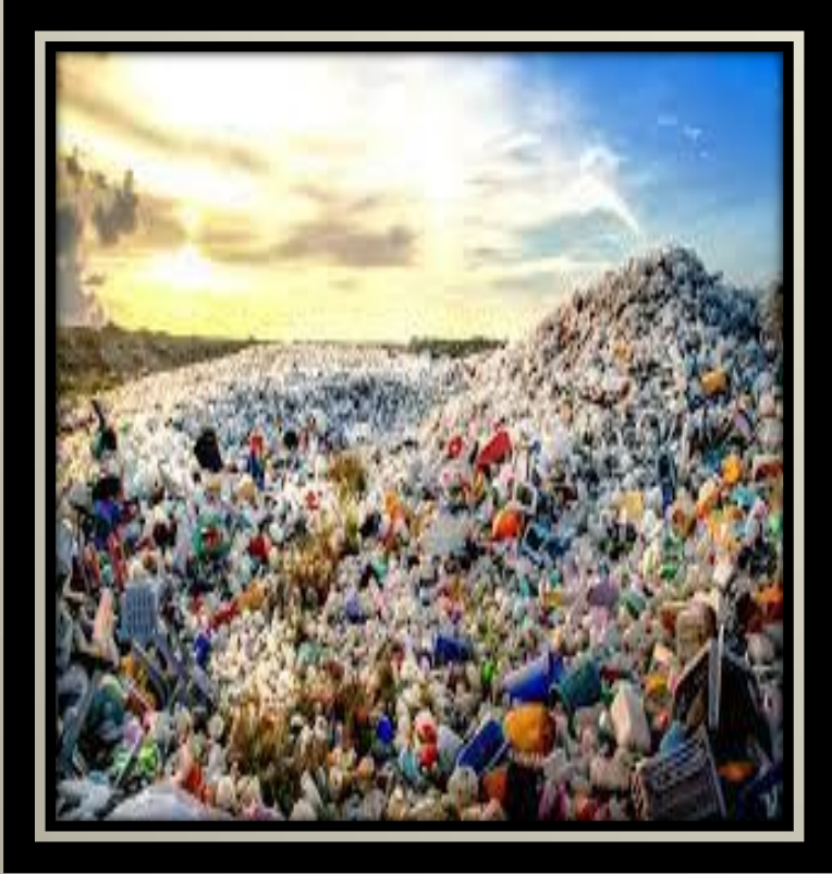
PLASTIC- A BOON OR BANE?