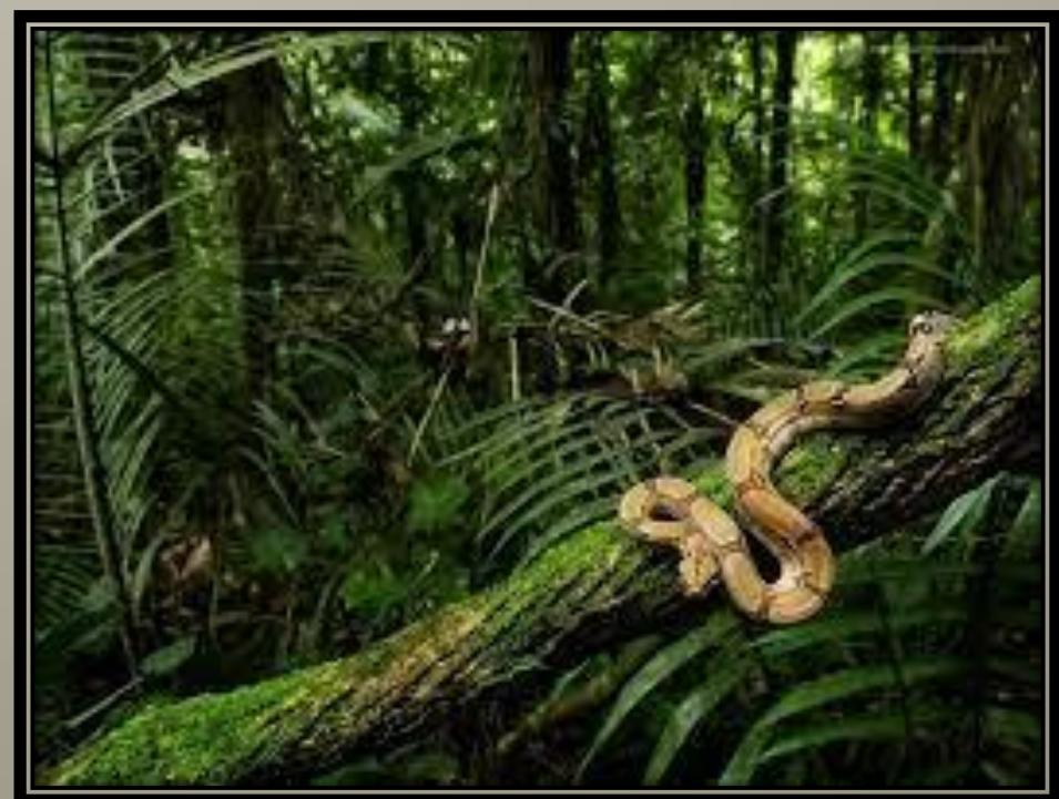
HABITATS MY HOME MY SHELTER