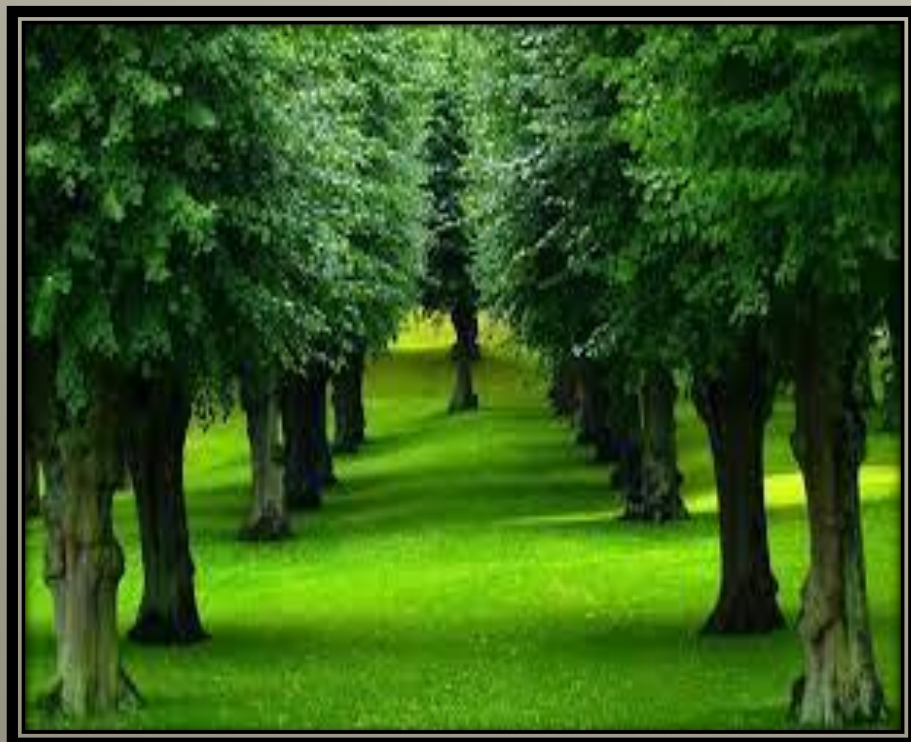
TREES HEART OF LIFE